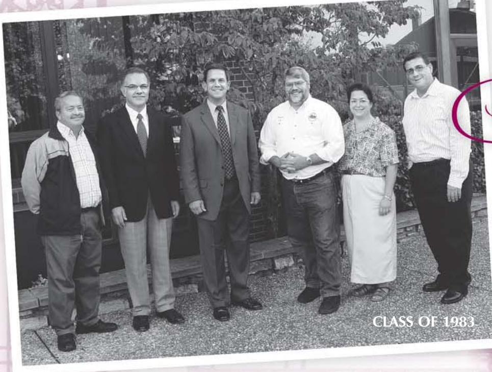
CLASS OF 1983