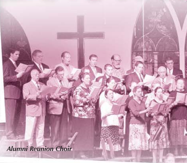
Alumni Reunion Choir