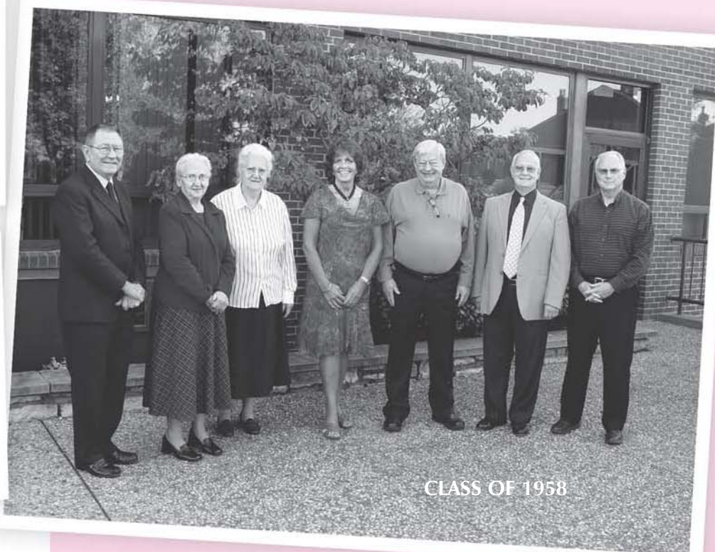
CLASS OF 1958