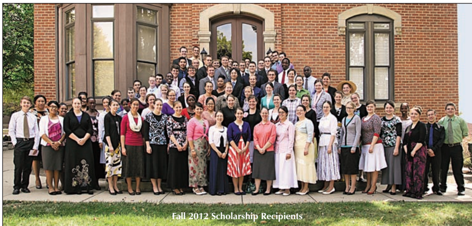
Fall 2012 Scholarship Recipients